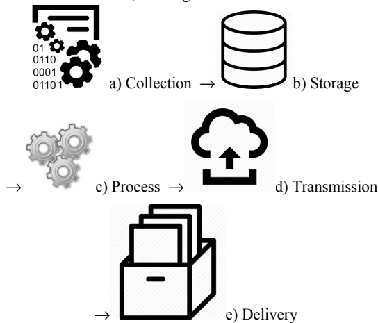
Figure 2. The stages of an IoT System

Given the huge amount of independent researches in the last decade, materialized in a large volume of new products on the market, the interoperability and scalability should be kept in mind, especially in a less standardized architecture compared to OSI. The stages of an IoT system can be summarized in five steps that are useful in defining a scalable architecture, as in figure 2.